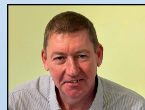
Ethical Standards Commissioner

In future, the ESC will give a brief office update in this space. For this issue, the ESC is sharing news that the office has recruited and inducted new team members into the investigations team following an extensive workforce planning exercise. The team has made progress with the complaints backlog, with complaints received up to June 2023 being allocated for assessment or investigation. The ESC website has a new page dedicated to keeping stakeholders informed about complaint handling times, available here . The ESC will publish progress against the targets and KPIs consulted on in the Investigations Manual at the financial year end. For any queries, please email investigations@ethicalstandards.org.uk .